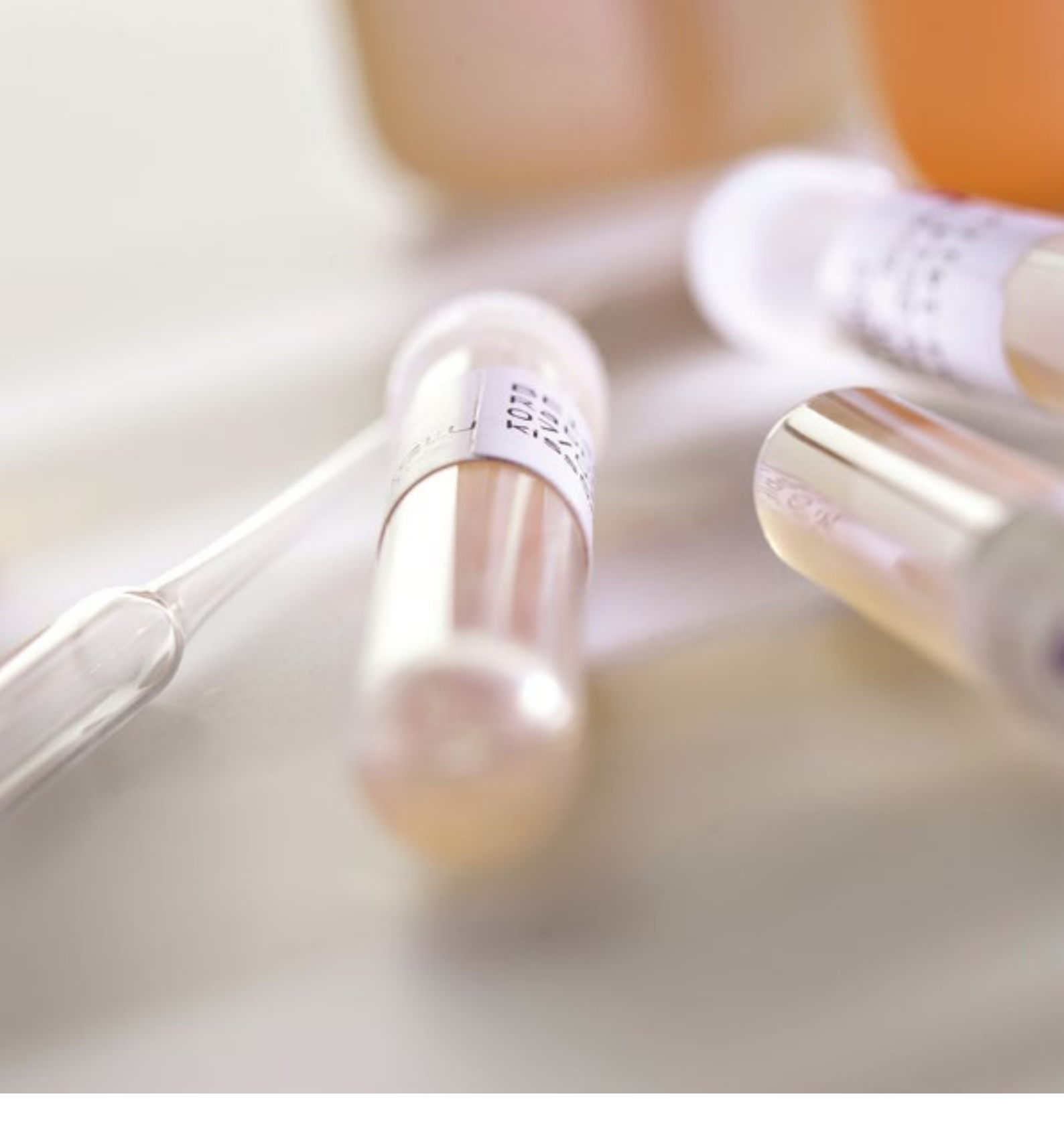
Specialists are always