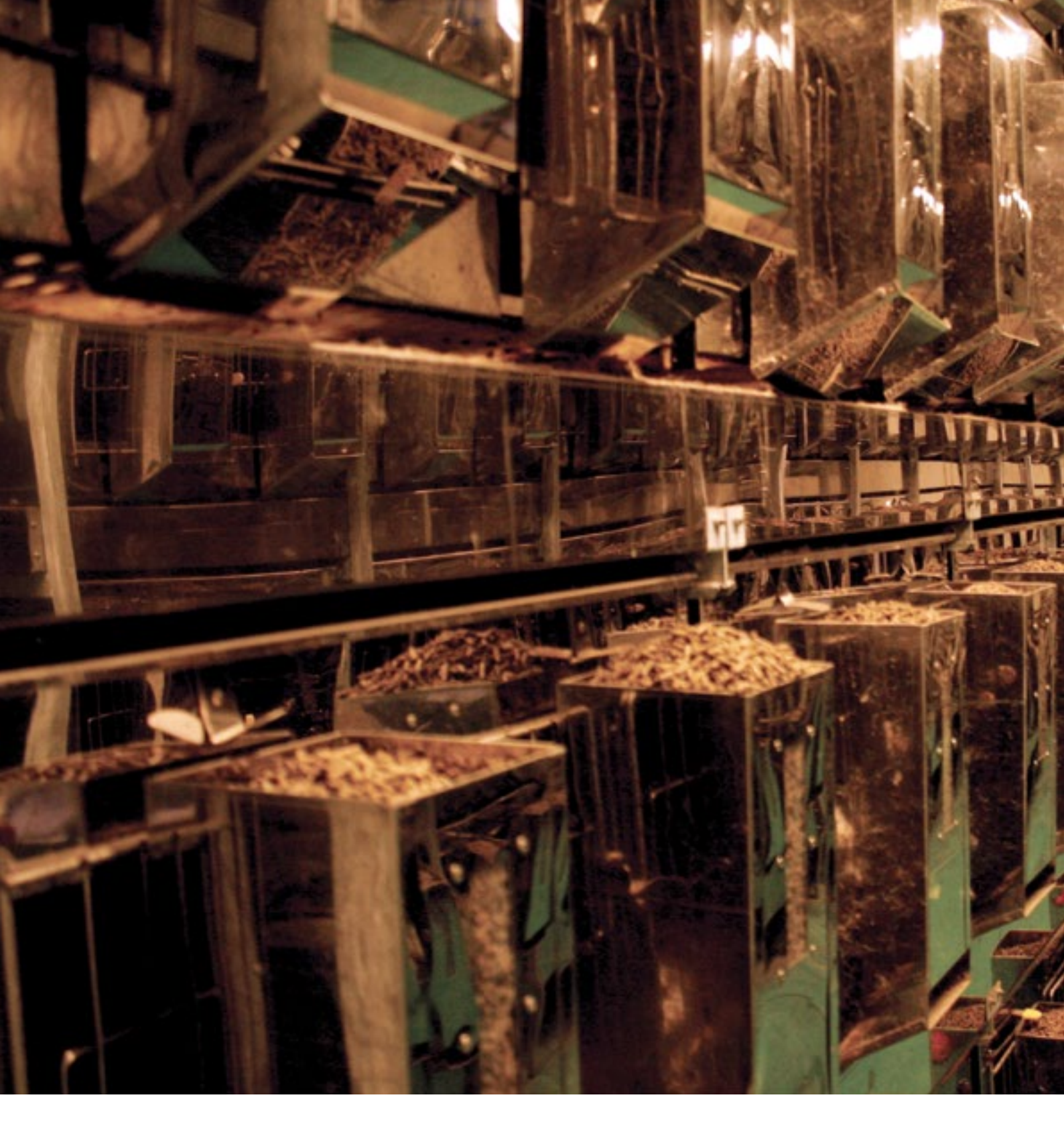
Each Animal deserves care,